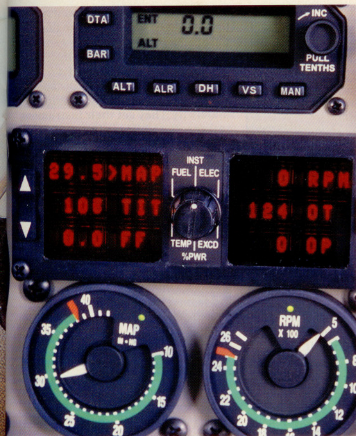
Vertically-stacked engine gauges and the digital display monitoring panel (DDMP) (left) give the airplane additional "big-iron" ambiance.